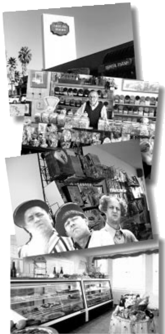
It's all right here in South Pasadena. Businesses pictured are Bristol Farms, Family Fair, Wonderyear and Dining with Andre.

So why fight the traffic and the crowds? It's all right here in South Pasadena. You'll not only find what you want this summer, but you'll also be supporting your local businesses!