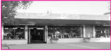
315 N. San Marino Ave.