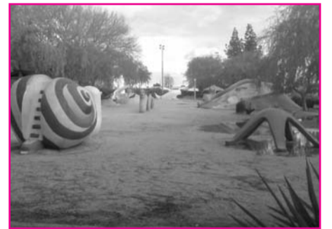
La Laguna De San Gabriel