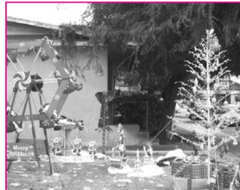
629 Dewey Way