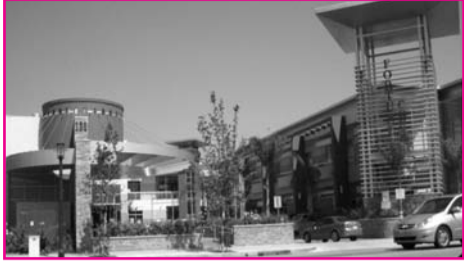
115 E. Valley Blvd.

There were five winning nominations this year. The categories and winners are: