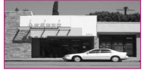
1011 E. Las Tunas Dr.