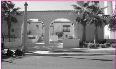
400-412 W. Mission Rd.

New Multi-Family: 400-412 W. Mission Rd. Architect: Wade Killefer (Killefer Flammang Architects). The composition, massing and architectural details of the individual buildings reflects the architectural vocabulary associated with the Spanish Colonial Revival style of the 1920s and 1930s. The architectural details used throughout the project and the appearance of the façades reflect the quiet dignity and simplicity associated with the Spanish Colonial Revival style.