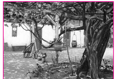
Famous Oldest/Largest Grapevine