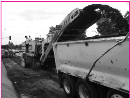
New Avenue, photo taken May 19, 2011. Roadwork underway!