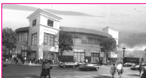
Crown Valley commercial building is located at 800 E. Valley Boulevard