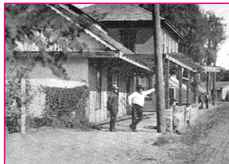
Old Grapevine Home - Vine planted 1765