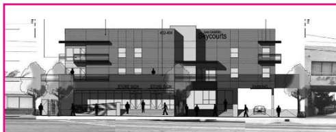
San Gabriel Skycourts will consist of 9,533 square feet of retail and restaurant space and 31 owner-occupied residential units at 402-404 S. San Gabriel Boulevard