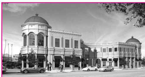
Hing Wa Lee Plaza, located at 1635 S. Del Mar, consists of 26,000 square feet of luxury designer retail stores, upscale restaurants, and office space

Lastly, Crown Valley, an attractive office and retail building has started construction at 800 East Valley Boulevard on the site of a former service station. These major projects will result in significant private investment, new shopping and dining options, and housing opportunities. Contact City Planner Mark Gallatin at (626) 308-2806, ext. 4623 or mgallatin@sgch.org for more information.