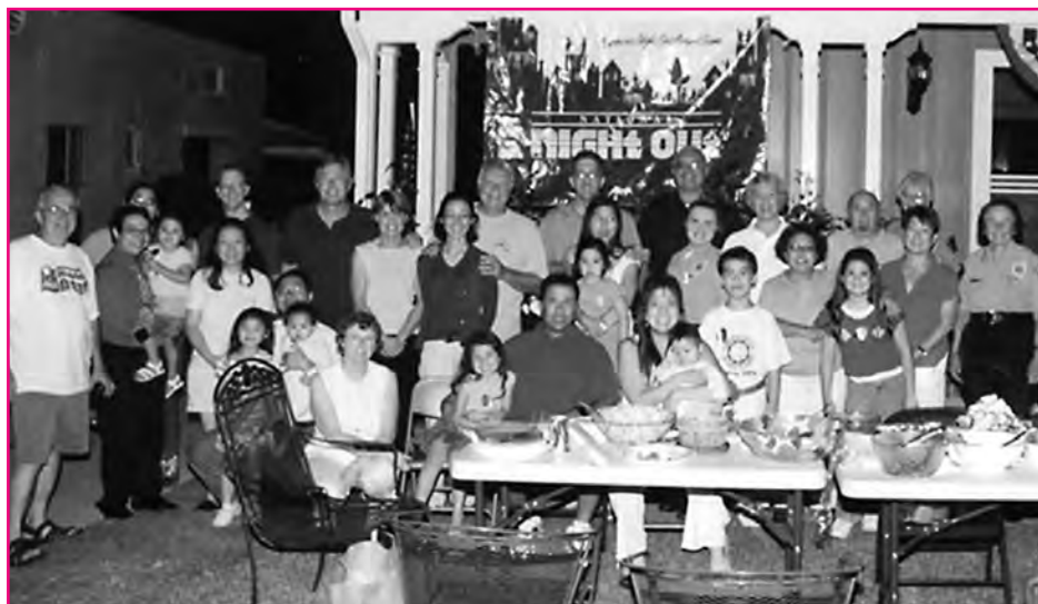
National Night Out provides an opportunity to know your neighbors