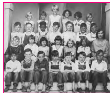
Class at Roosevelt School, circa 1930

San Gabriel has historically been one of the most multicultural areas in California, and it is important to acknowledge the work and worth of everyone who has contributed to our community.