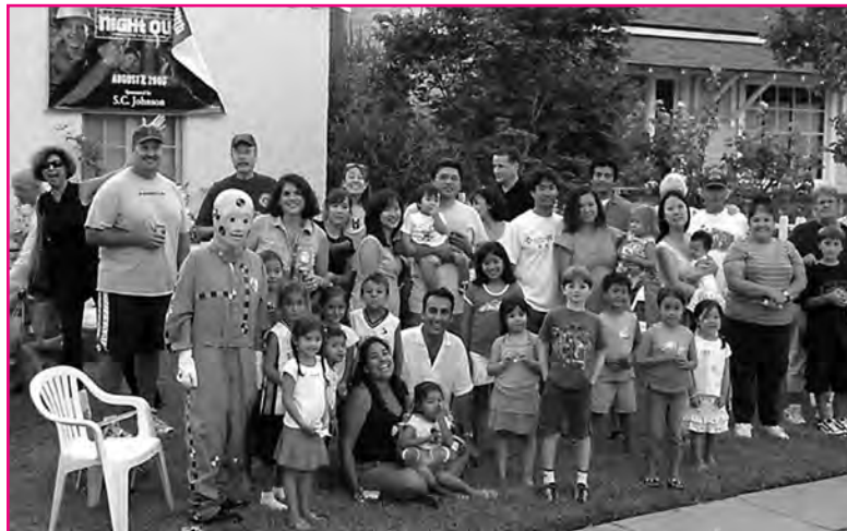
Hosting block parties has become an annual program tradition