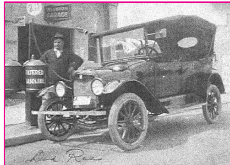
Mission Garage - A.W. Roe - 1922