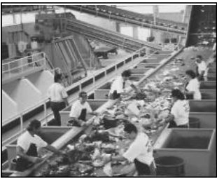
Organizing recycled items at Athens Services

Ever wonder what happens to all that refuse that's picked up each week? Athens Services has been servicing the San Gabriel Valley since 1957 and is the largest provider of refuse removal and recycling services. The company ser vices more than 20 cities in the region, including the City of San Gabriel.