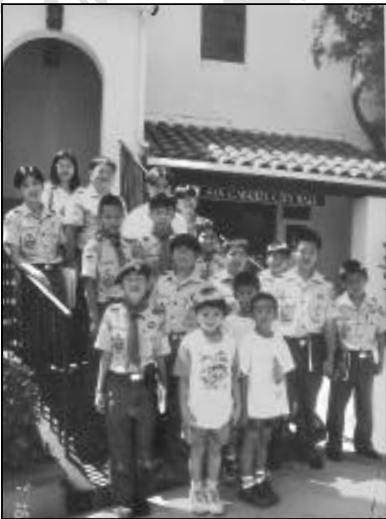
Boy Scout Troop #228 visited City Hall to learn how local government works.

Recently, San Gabriel Boy Scout Troop #228 visited and toured City Hall as part of their requirements to earn merit badges. City staff provided the troop with information about how local government works, City demographics, maps and lists of local, state and federally elected officials. The troop also attended a City Council meeting and saw first-hand how local government works. Each troop member sent a personal note to City Hall staff thanking them for the information, the tour and for helping them achieve their merit badges.