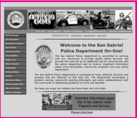
Visit www.sgpd.com and discover the San Gabriel Police Department

“The Police Department encourages a problem solving, community policing philosophy and works collaboratively with the community in addressing problems of crime and disorder”