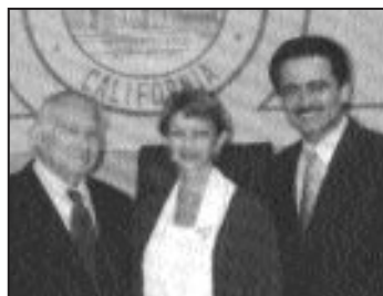
The City hosted its first California State Senate Hearing.