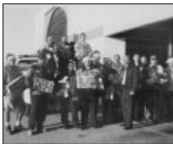
Santa and all of his helpers will be visiting the City's neighborhoods on Christmas morning.