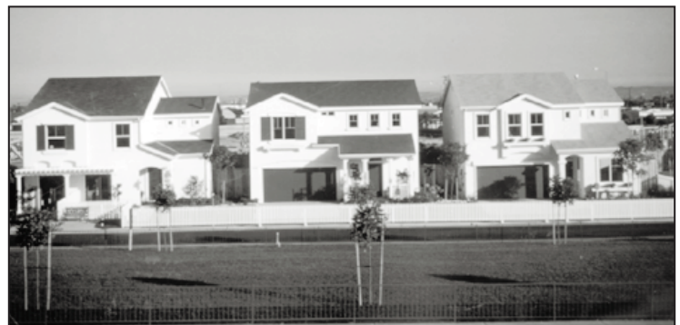
Village Green is an energy-efficient community.

Metrolink to work, leaving their cars behind.