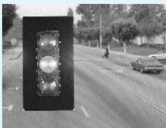
New traffic signals will improve pedestrian safety.

In addition, there will also be traffic signal synchronization and timing modifications to the adjacent intersections on Hubbard at First Street, Truman Street, San Fernando Road and the railroad crossing. The developer will fund all of these improvements. The traffic signal will be installed in conjunction with the sale of the 75th home, which is anticipated to be in July 2000.