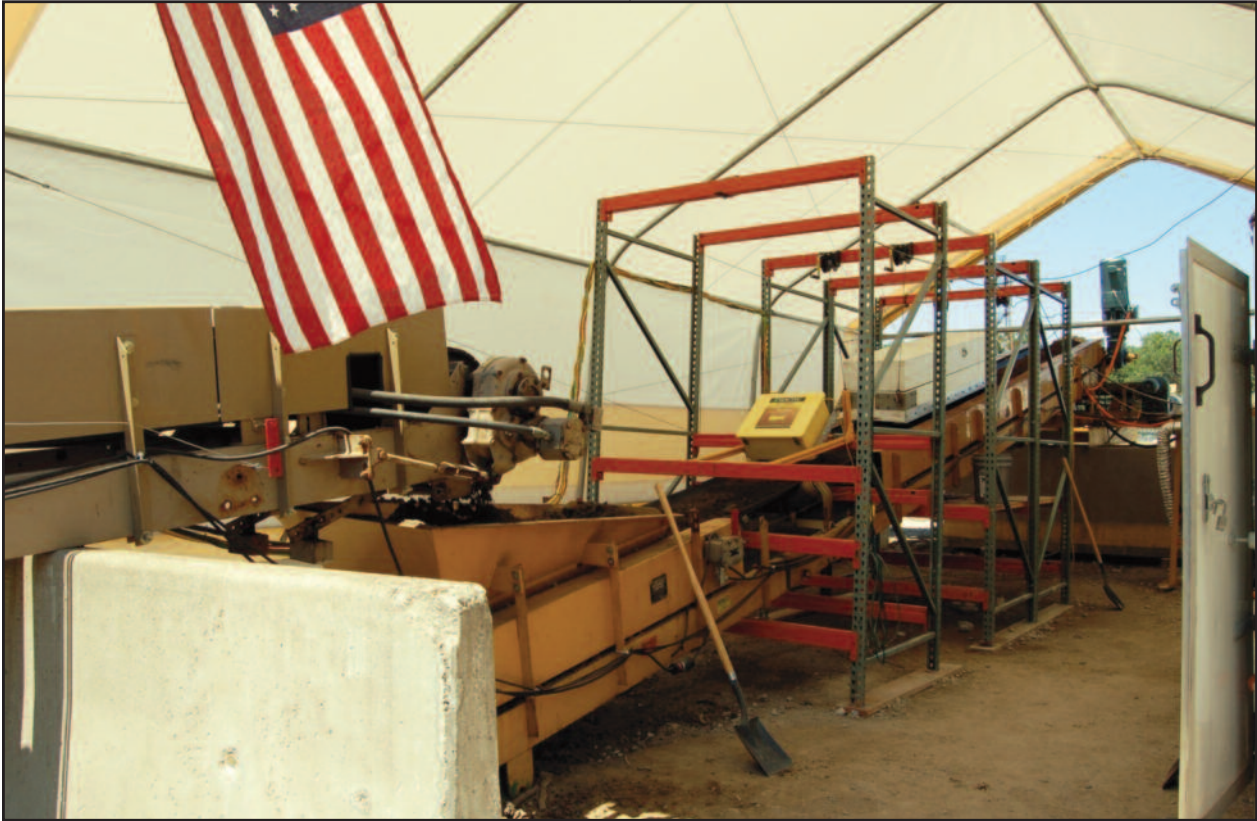
Material on the survey belt with nuclear measurement gauge (yellow box) and spectroscopy detectors (white box).