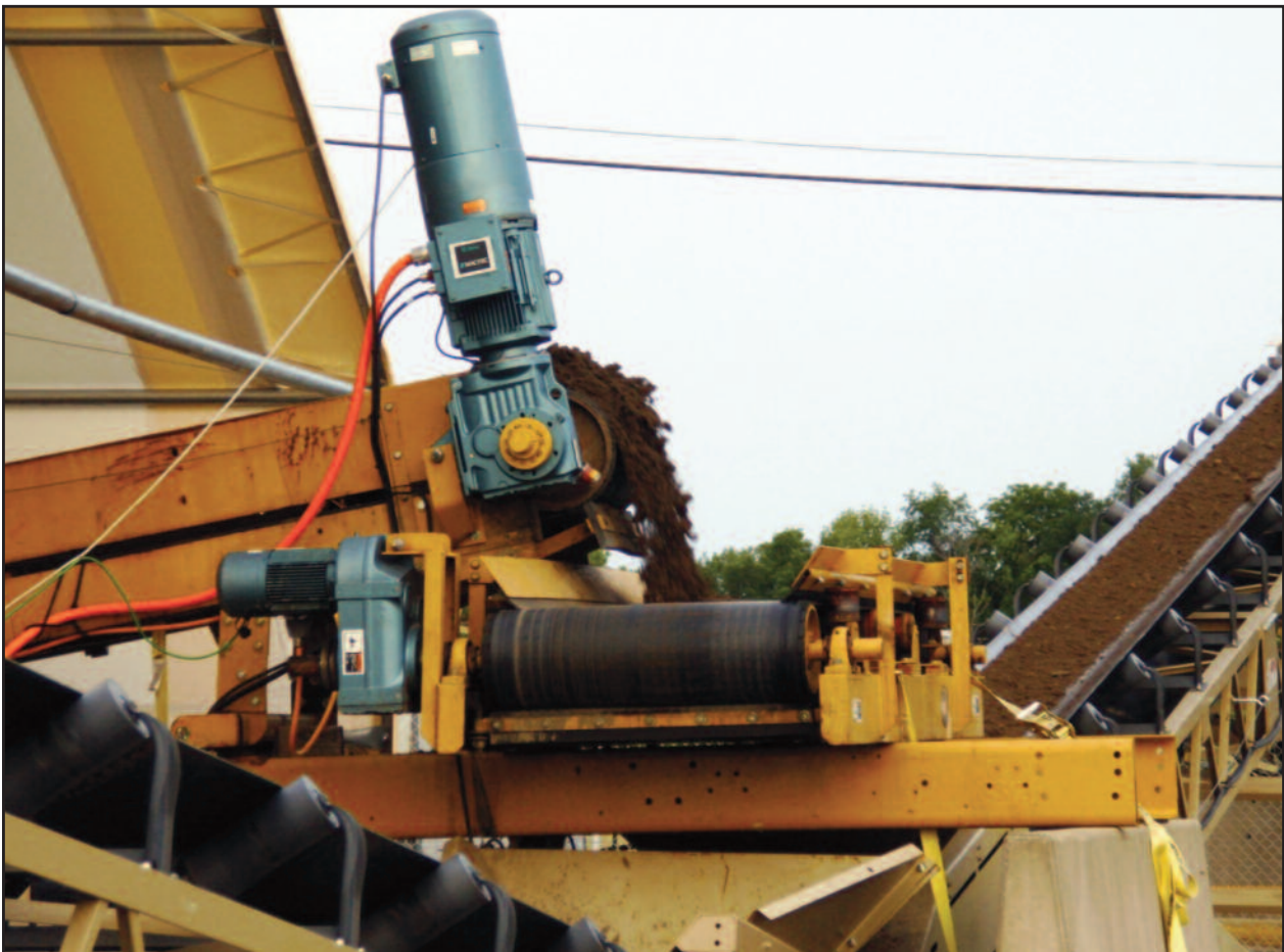
Proprietary Orion ScanSort reversing conveyor. Following radiological assay by spectroscopy detectors, the reversing conveyor sorts material to "un-impacted" or "contaminated" stockpiles.