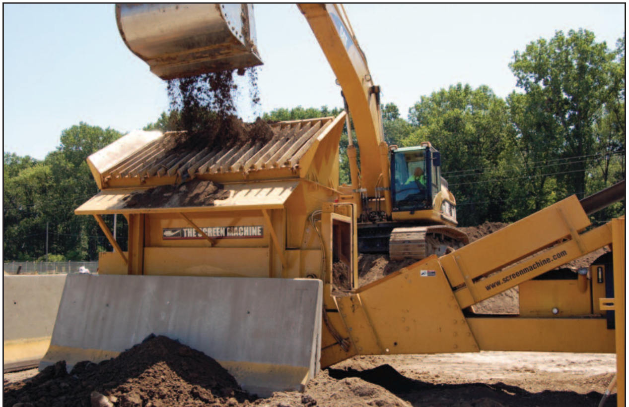
Soil material is loaded into the screener for removal of large debris. The screened material is then discharged onto the Orion ScanSort survey belt for radiological assay.

As of May 2010, more than 80 000 tons had been processed, and soil processing for the project is expected to be completed by August 1, 2010. The targeted daily production rate was 550 tons/day. In the summer and fall months, with minimal weather delays, typical production rates were nearly 1500 tons/day; in winter months, production rates averaged about 500 tons/day.