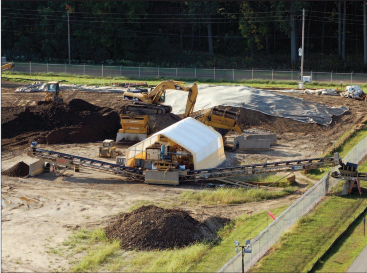
Overhead view of ScanSort operations. Un-impacted material is stockpiled for reuse as onsite backfill material, while contaminated material is stockpiled for future offsite disposal.

The system is expected to reduce the volume of radioactive waste by up to 95 percent, compared with that from simply excavating it and disposing of it as radioactive waste.